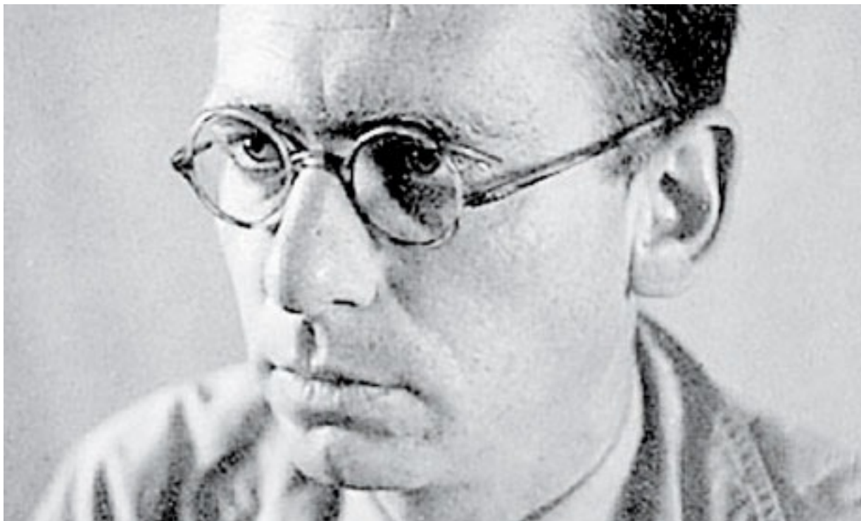
Patrick Hamilton.

The Family Tree of Novelist, Patrick Hamilton